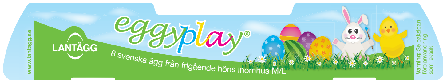
Example, season label