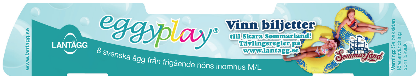
Example, special label with competition teaser

Images/illustrations from the eggypay image bank may be used in label designs. Please contact us if you need access to the image bank.