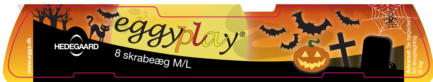
Example, season label